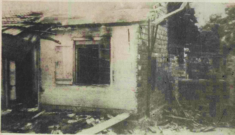
A charred shell of a house torched by the terrorists.

The LTTE terrorists who descended on the Sinhala village Bowatte in Welikanda in the Polonnaruwa district early on Saturday morning hacked to death 37 men, women and children. Seven villagers escaped with injuries. The terrorists torched the homes of the victims before making their getaway.