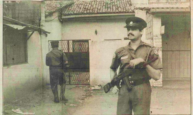
House of terror: From where the operation began