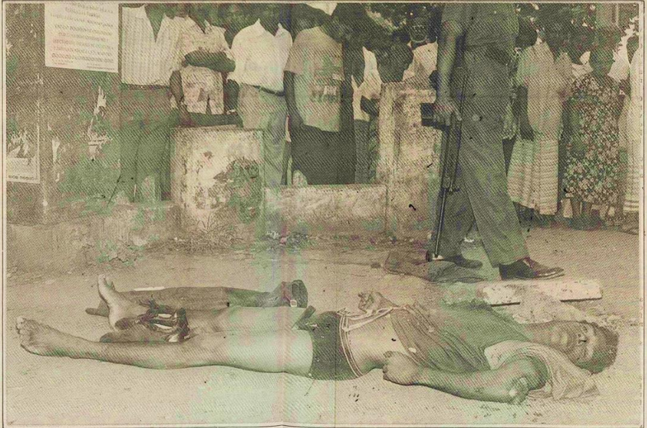
Death of a destroyer: the body of an LTTE terrorist killed at the Baseline Road check-point