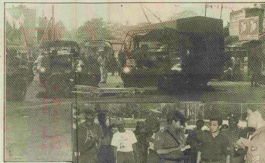
The aftermath: a magistrate conducting an inquest at Kolonnawa