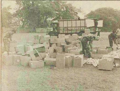
Early breakthrough: the bomb disposal squad examining the cartons unloaded from the get-away lorry