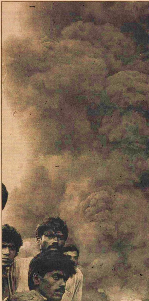
Sri Lankans came out yesterday to watch the fires at an oil storage depot in a Colombo suburb.

Following the explosions at Colombo's main Kolonnawa depot and smaller nearby Oruduwatta depot, about three kilometres from the city centre, heavy fighting broke out between security forces and attackers trapped in the compound. At least 25 people were wounded in the shooting, but most of the rebels escaped.