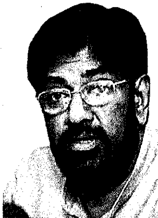
Minister Keheliya Rambukwella