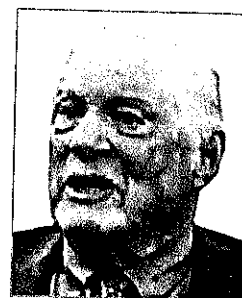
Robert L. Bernstein

Human Rights Watch founder Bernstein accuses HRW of allowing repressive regimes to play a "moral equivalence game" by failing to distinguish from open and closed societies. Of failing to recognize the difference available from open and closed societies. Also, of failing to recognize the difference between wrongs committed in self-defence and those perpetrated intentionally.