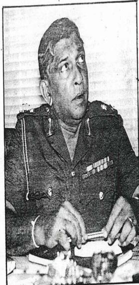
Lt. Gen. Cecil Waidyaratne: effects new promotions